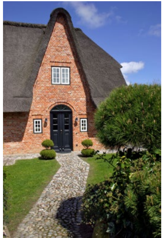
Fig. 30 Marking the territory

him that is respected as his? Etc., etc. The man needs a territory in order to secure a boundary, even if this is just a small space. Swelling of the prostate gland in older men who have no territory to secure, who often tend to be denigrated as part of the "house inventory" by a dominant female regiment, are homemade. Enlightenment is urgently necessary here. The older man also needs a territory that he can secure and mark. This has a positive effect on his health, as well as that of his partner, children and grandchildren. The security that radiates from a man is instinctively perceived by the outside world since these are messages of natural laws that are controlled by the old brain. People can be as modern as they like, but