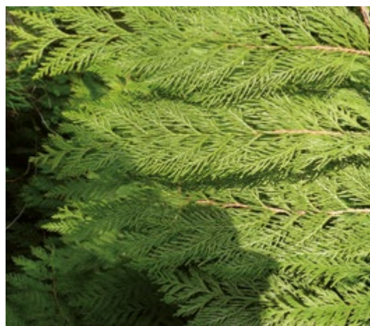
Fig. 11 Thuja plicata

genic state. In any case, the healing of sycosis is the uppermost imperative so that relapse does not happen and the necessary space is available for conflict resolution. Sycosis consists of the elements of water and earth, which combine to form the fertile humus soil in nature and in the figurative sense in the woman. Everything begins to flow, which also includes feeling, crying, menstruating or – beyond menses – the sense for the life rhythm. In the sycotic layer, the focus of interest is no longer on the biological healing attempts of the organism; instead, the recognition of the conflict, the willingness to resolve it and the intelligent ideas for solutions are important. Once this process has been set into motion, Thuja gradually loses its meaning and the related Sabina tree can continue the healing process. Almost no miasmatic therapy for chronic illnesses can work without Lycopodium since this wonderful remedy represents the middle (secondary sycosis), the healthy feedback of feelings and thoughts to the self as the big SELF. This is the healing phase in which patients become aware of what is good for them and what is not, deciding where they want to invest their energies in the future and where they do not want to invest them. In short, they come