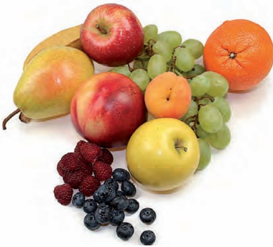
Figure 31: Fruit

and thus stimulating the body's own healing programmes. Nowhere is this clearer than with the large intestine where things come full circle. When the abdominal brain is reactivated, more digestible input enters the mouth and when healthier food is gratefully received, the intestinal flora regenerates. Of course we have to support the digestive system here and there and maintain an unshakeable faith in the wisdom of the body, but actually it is these normal vegetative functions which have to come into force before we can think about complicated psychotherapeutic processes.