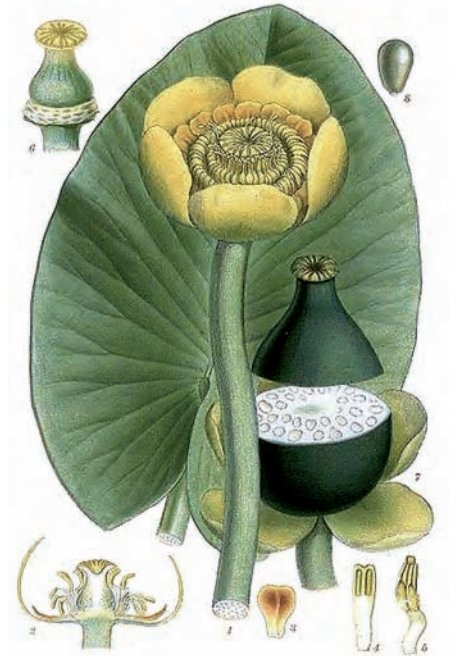
Figure 32: Nuphar luteum - Yellow Pond Lily

with ulcerative damage to the intestinal wall with bloody, slimy diarrhoea from repeated inflammation. Often an autoimmune condition develops which may become cancerous because the sufferer takes on the fatalistic victim role. When something is repeated the sycotic level has been reached.