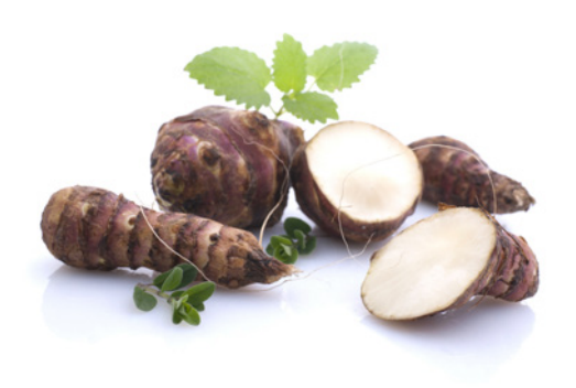
Fig. 29 Topinambur