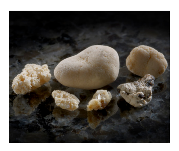
Fig. 60 Kidney stones

Radium bromatum : Strong, seizure-like pain in the joints of the arms and legs occur; beginning reconstruction (deformation) of the joints.