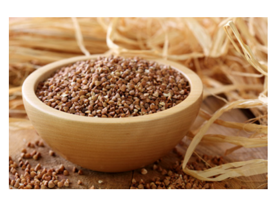
Fig. 30 Buckwheat