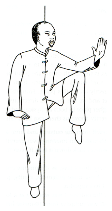
Figure 4.1 This dynamic, vertical alignment is what the Tai Chi master seeks (Graphic by Brenda Brown www.odesk.com)

The vertical axis of life on which Helium is situated runs from midheaven, through the vertex of the head, down the spine, out through the perineum and down to mid-earth. This is the line of the noble gases, the spine of the periodic table. It is the central axis around which a healthy, nonpsoric person revolves, being in the perfect position rather than having a disposition.