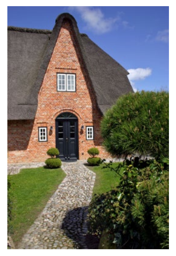
Fig. 30 Marking the territory

him that is respected as his? Etc., etc. The man needs a territory in order to secure a boundary, even if this is just a small space. Swelling of the prostate gland in older men who have no territory to secure, who often tend to be denigrated as part of the "house inventory" by a dominant female regiment, are homemade. Enlightenment is urgently necessary here. The older man also needs a territory that he can secure and mark. This has a positive effect on his health, as well as that of his partner, children and grandchildren. The security that radiates from a man is instinctively perceived by the outside world since these are messages of natural laws that are controlled by the old brain. People can be as modern as they like, but