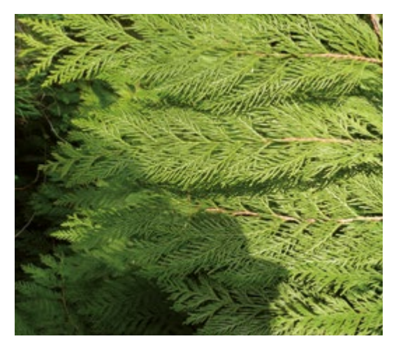
Fig. 11 Thuja pliccata

genic state. In any case, the healing of sycosis is the uppermost imperative so that relapse does not happen and the necessary space is available for conflict resolution. Sycosis consists of the elements of water and earth, which combine to form the fertile humus soil in nature and in the figurative sense in the woman. Everything begins to flow, which also includes feeling, crying, menstruating or - beyond menses - the sense for the life rhythm. In the sycotic layer, the focus of interest is no longer on the biological healing attempts of the organism; instead, the recognition of the conflict, the willingness to resolve it and the intelligent ideas for solutions are important. Once this process has been set into motion, Thuja gradually loses its meaning and the related Sabina tree can continue the healing process. Almost no miasmatic therapy for chronic illnesses can work without Lycopodium since this wonderful remedy represents the middle (secondary sycosis), the healthy feedback of feelings and thoughts to the self as the big SELF. This is the healing phase in which patients become aware of what is good for them and what is not, deciding where they want to invest their energies in the future and where they do not want to invest them. In short, they come