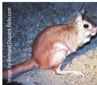
Springhare- Pedetes capensis