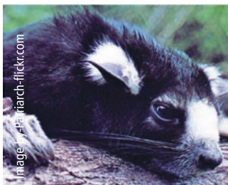
Flightless Scaly-tailed Squirrel- Zenkerella insignis

Squirrel, Beaver, Anomalure, Springhare, Prairie Dog, Flying Squirrel, Chipmunk, Marmot, various types of tree and ground squirrels.