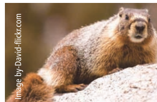
Alpine marmot- Marmota marmota