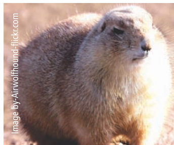
Prairie dog- Cynomys parvidens