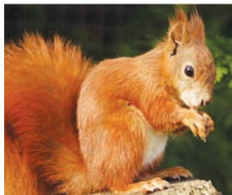
Red squirrel- Sciurus vulgaris