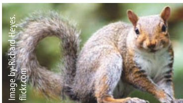
Ground squirrel- Sciuridae