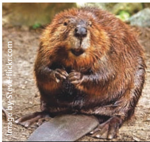
Beaver- Castor fiber