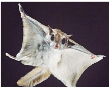
Flying squirrel Genus- Pteromyini